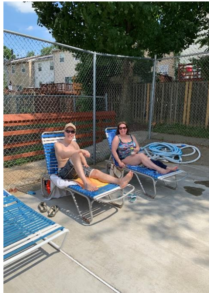
Residents relaxing by the pool