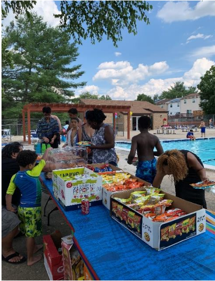
Refreshments and a little something to wet your whistle!

The MOM HOA Pool Party was held on Saturday, June 29th. Attendees enjoyed pizza and other sorts of refreshments while swimming in the community pool. It was well attended by all ages!